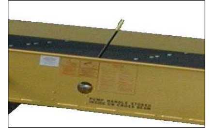
Pump—Hydraulic hand pump quickly adjusts top end of ramp with the bed of the vehicle or loading dock. The handle is stored out of the way when not in use.

Smooth Side Plates - enclose all working components and protect them from possible damage from other equipment.