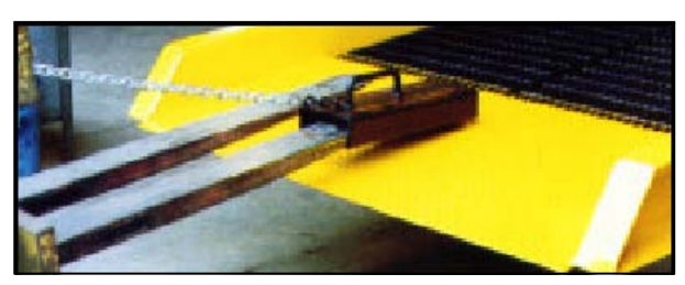
Positioning Sleeve—(Standard on steel models) provides dependable means of positioning the ramp into place from one truck to another. When not in use the sleeve is conveniently stored on the side of the Containeramp. Not intended for long distance towing.