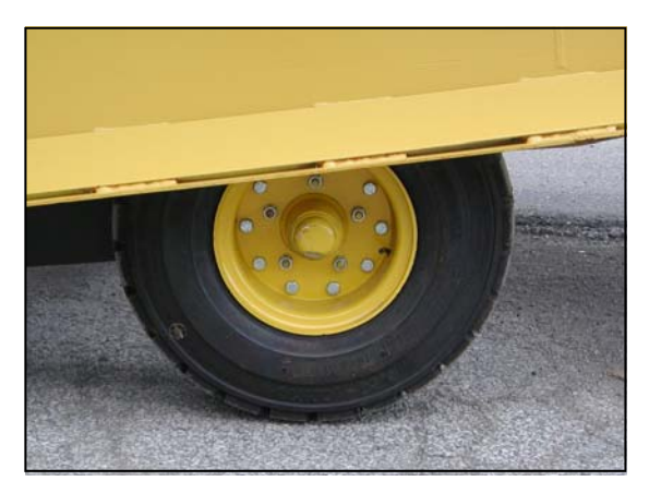
Pneumatic Tires— (Standard on all ramps) Premium 23" tires, ideal for use in most applications. Air inflated tires create a cushion effect on irregular or bumpy surfaces. Solid Filled Tires- (Option on all ramps) Ideal in applications where sharp debris could puncture a pneumatic tire.