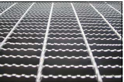
Deck Grating—Constructed of electroforged serrated steel for superior strength. Grating bearing bars are 2 1/4" thick for durability in the roughest of applications. Bars are spaced 1" apart to resist clogging of debris and to insure al all-weather high traction running surface.

Low End Plate—Only 30" long. Because the end plate is shorter than the wheelbase of most fork lift trucks, front drive wheels can runoff. Exclusive hollow section design and reach high traction grating on the ramp while rear wheels are still on the ground. Approach plate is beveled from the underside cargo breakout. to provide a smooth ground-level entry, eliminating jolts and bumps when fork trucks travel on and off the ramp