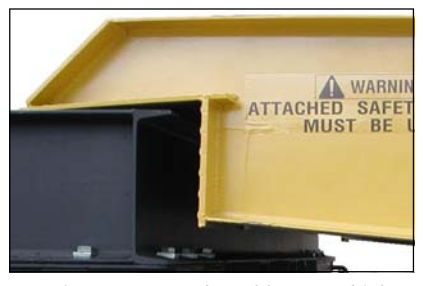
15" Lip—Deep overlap of frame at high end is assurance that the ramp rests firmly on the carrier body or dock floor. Eight foot long safety chains and hooks are provided for added security. When correctly rigged, chains join the ramp and vehicle into a single unit.