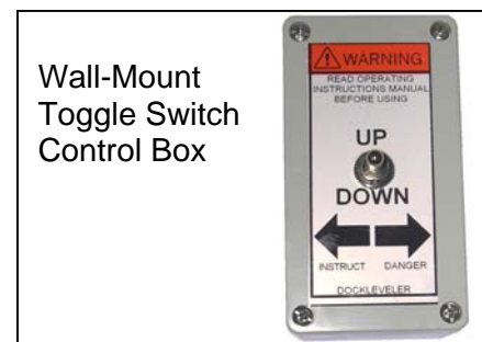
Wall-Mount Toggle Switch Control Box